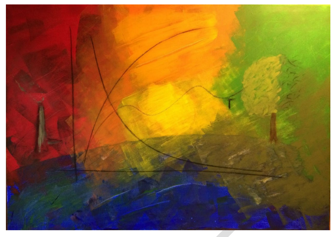
Figure 1 / 'Climate transition of the world' Painting 2014

Ecology and economy in secondary steel production – or how to meet the goals of the energy and climate transition with profit.